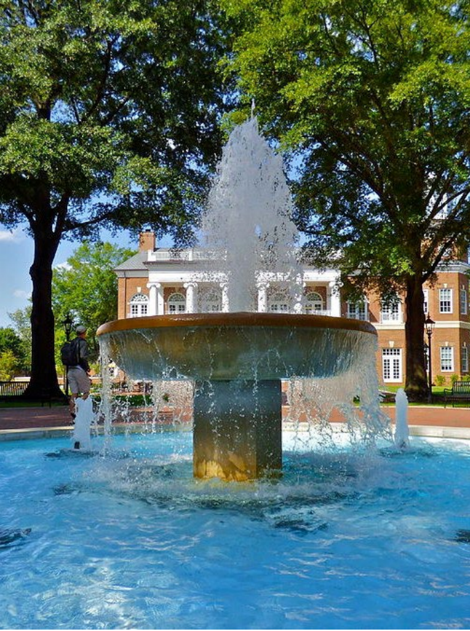
Photo: Fountain at Downtown, Ashland, VA