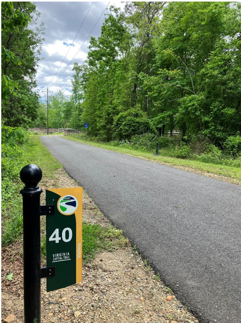
Photo: Virginia Capital Trail, Varina