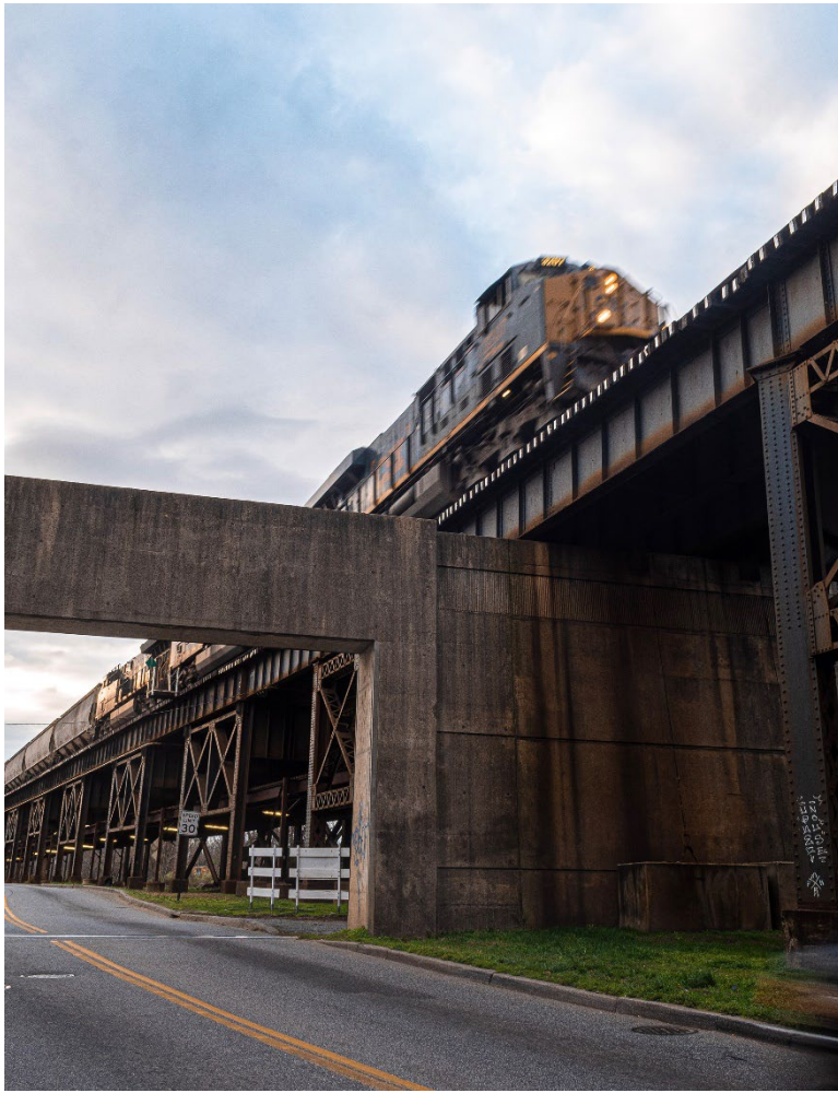
Photo: Train near Canal Walk