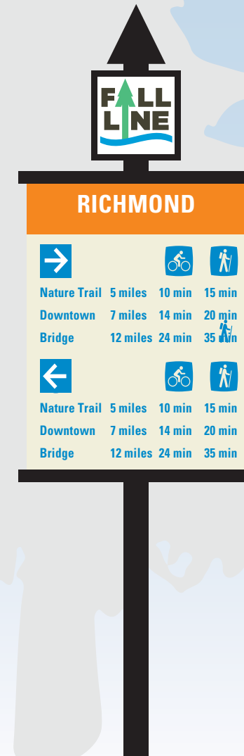
Sign Type P2 Pedestrian Directional

THIS DRAWING REPRESENTS DESIGN INTENT ONLY.