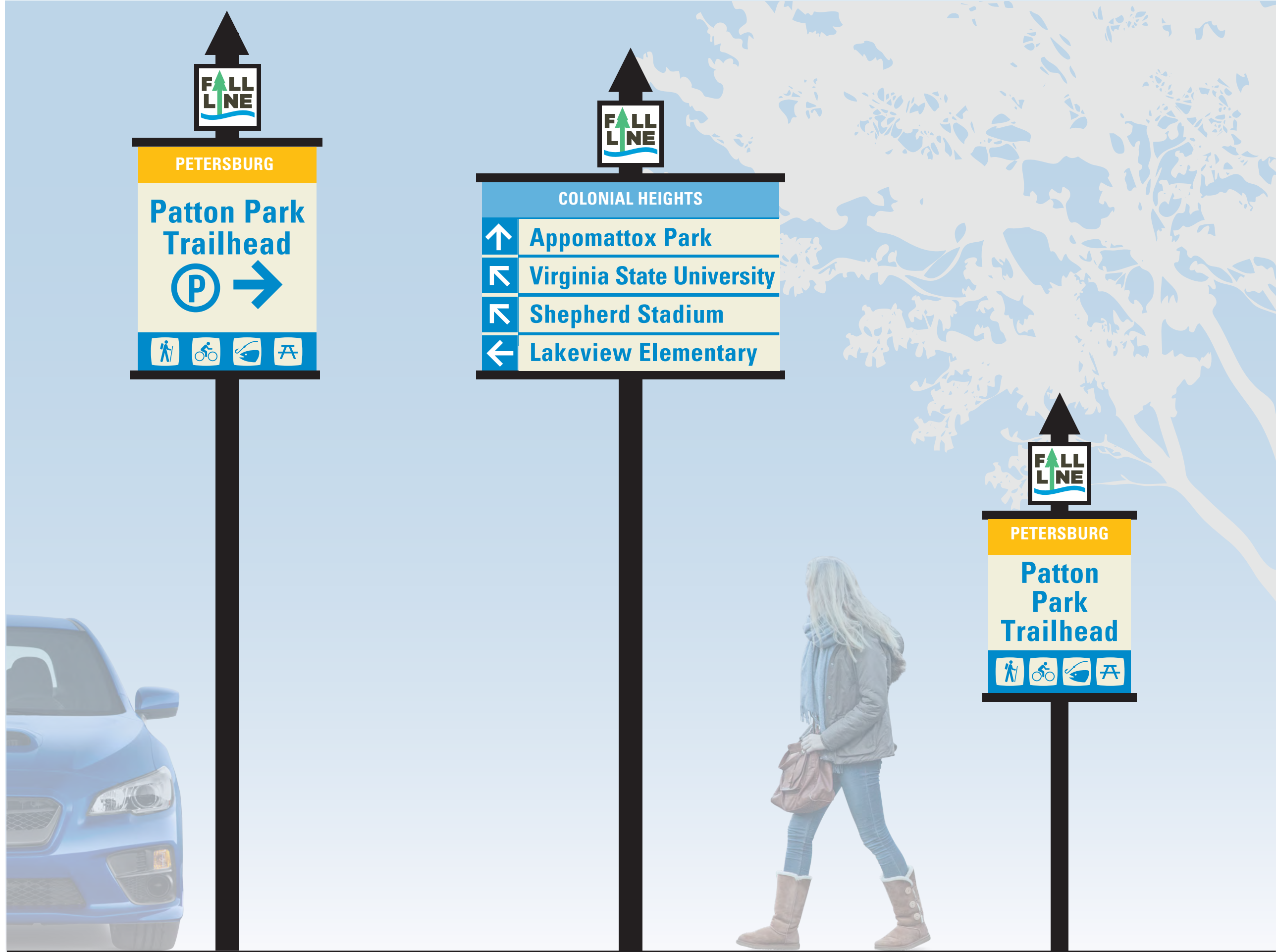
Sign Type T1 Vehicular Trailhead Sign