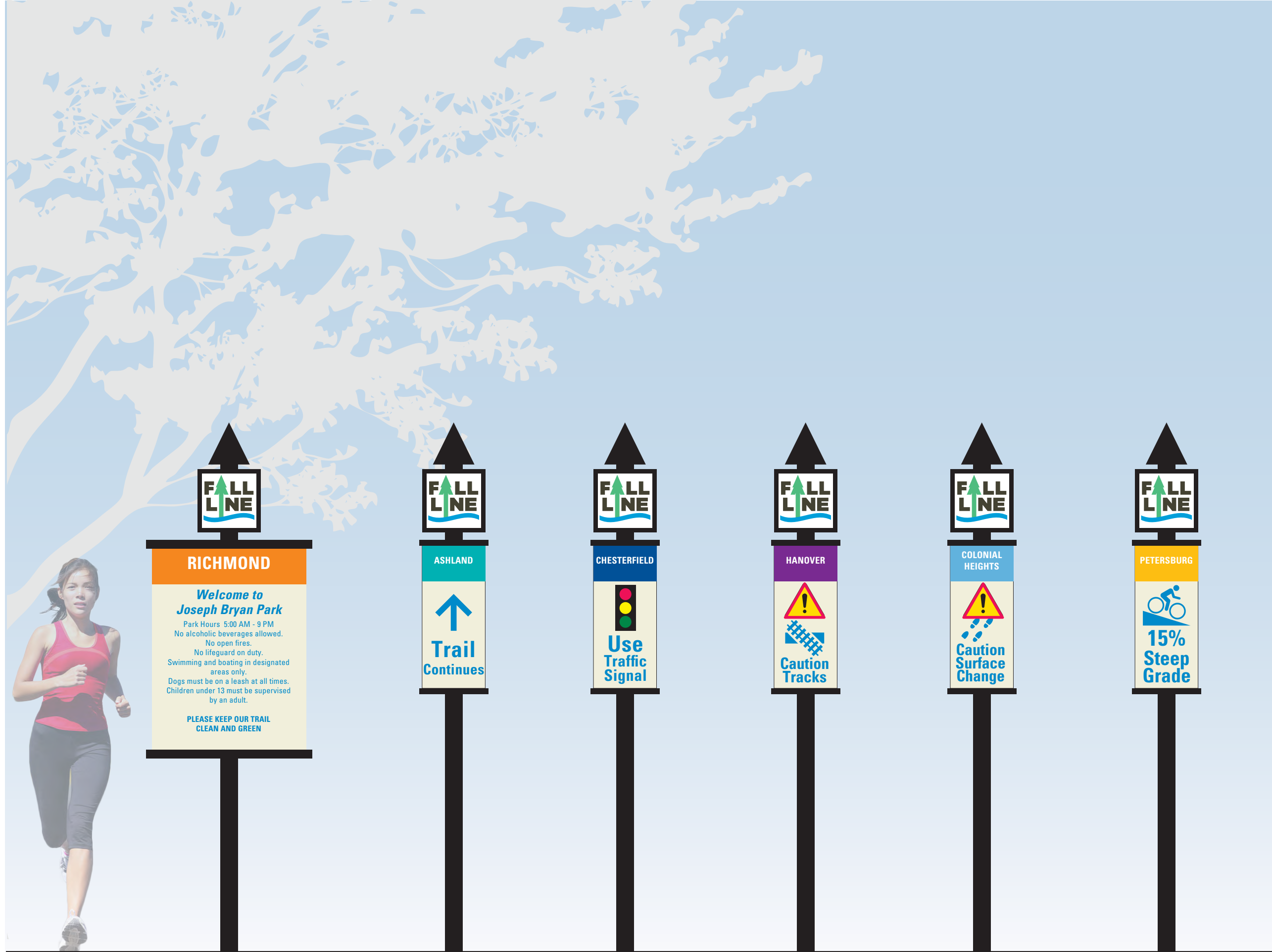
Sign Types R1 Regulatory Sign