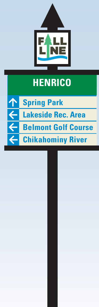
Sign Type P1 Pedestrian Directional