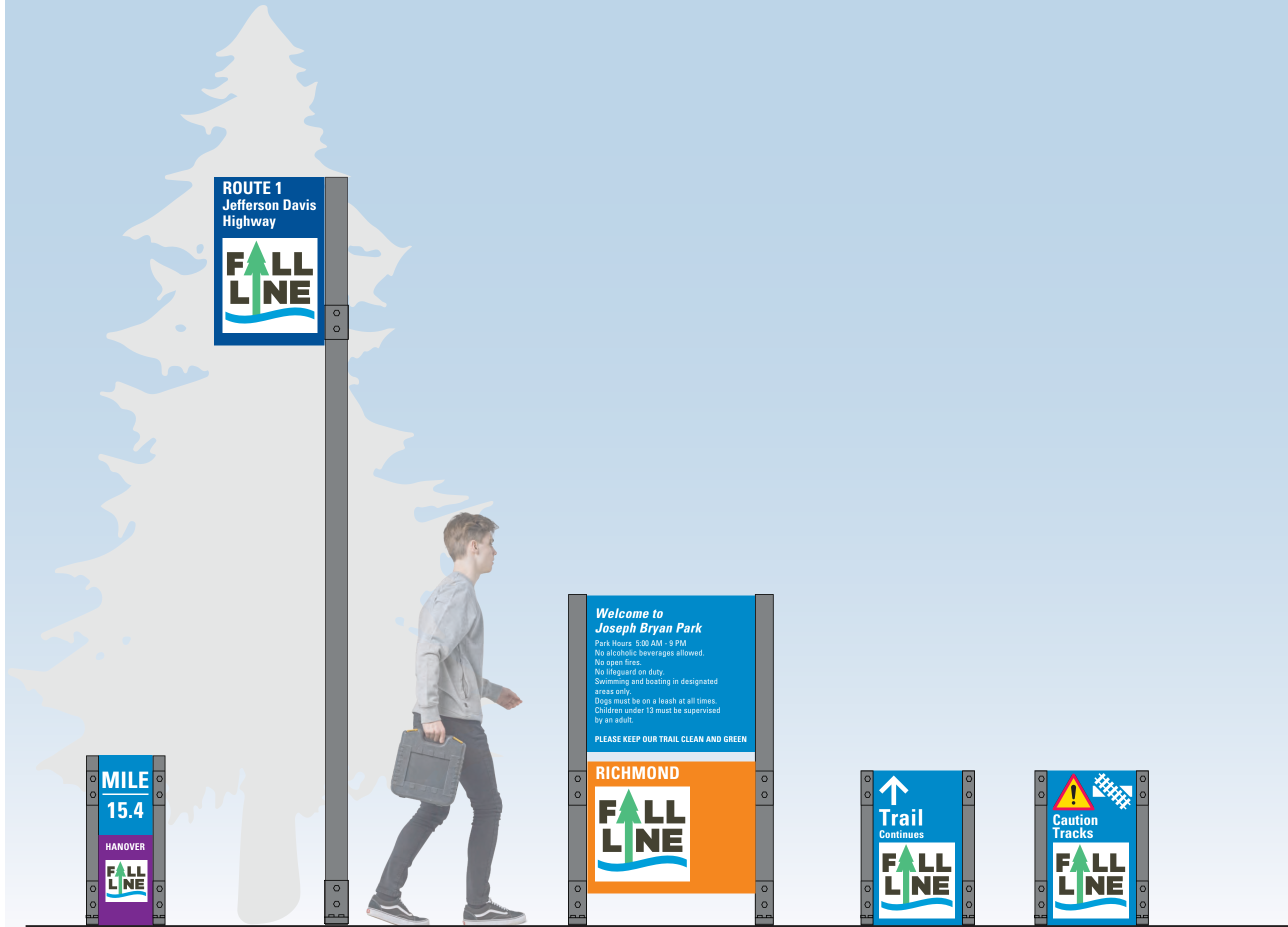
Sign Type M1 Mile Marker