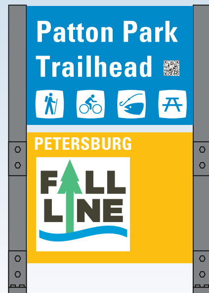
Sign Type T2 Pedestrian Trailhead Sign