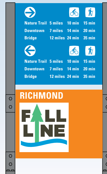
Sign Type P2 Pedestrian Directional

THIS DRAWING REPRESENTS DESIGN INTENT ONLY.