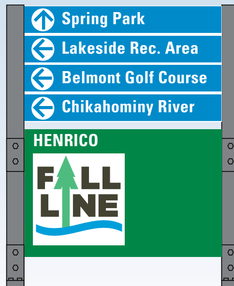
Sign Type P1 Pedestrian Directional